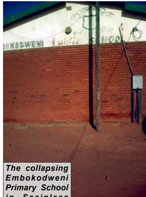
The collapsing Embokodweni Primary School in Saaiplaas poses danger to lives of hundreds of learners.